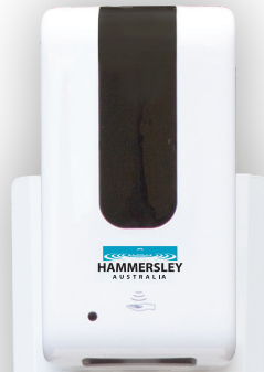
UNIT WITH FULL STAND